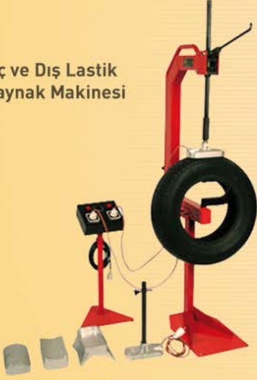
İç ve Dış Lastik Kaynak Makinesi