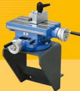
STANDART LATHE SUPPORT