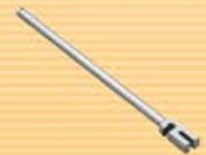
1 pcs bead straightening lever