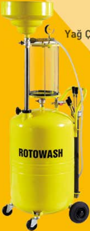
Yağ Çekme Kovası