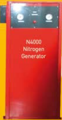
N4000 Nitrogen Generator