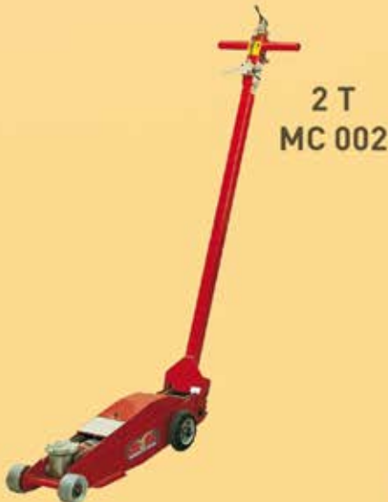
2 T MC 002