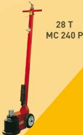
28 T MC 240 P