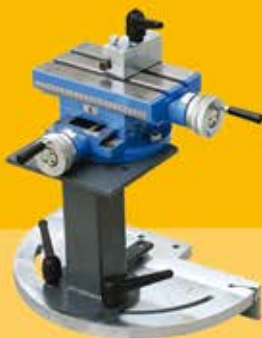
TURN TABLE LATHE SUPPORT