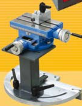
TURN TABLE LATHE SUPPORT