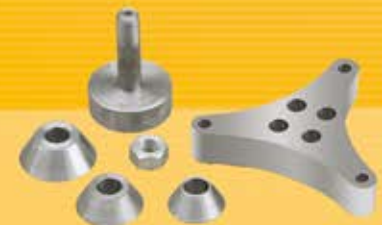
MOTORCYCLE FLANGE KIT