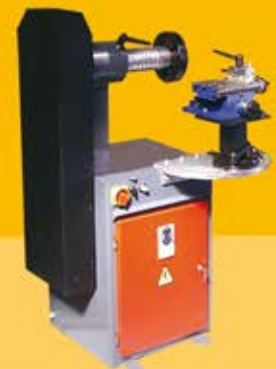
RIM LATHE MACHINE