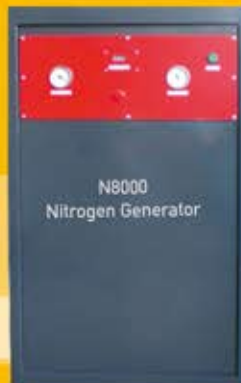
N8000 Nitrogen Generator

Passenger Car-Light Truck and Heavy Goods Vehicles for the Nitrogen Compressor