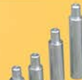
4 pcs piston lengthening arms