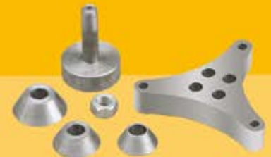
MOTORCYCLE FLANGE KIT