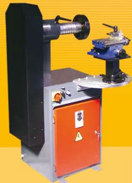
RIM LATHE MACHINE