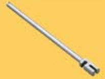
1 pcs bead straightening lever