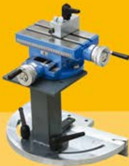
TURN TABLE LATHE SUPPORT