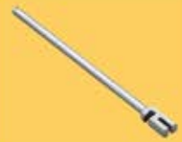
1 pcs bead straightening lever