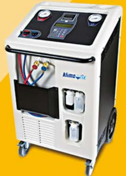
AUTOMEK 2000 Klima gazı dolum cihazı