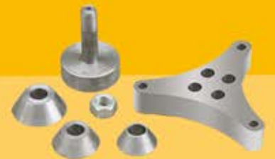
MOTORCYCLE FLANGE KIT