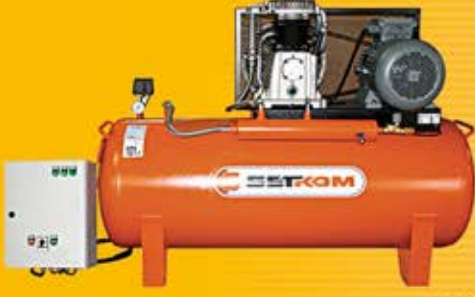
SF2 Çift Kademeli