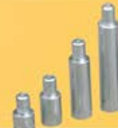
4 pcs piston lengthening arms