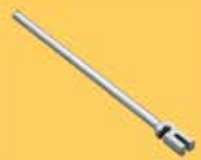
1 pcs bead straightening lever