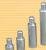
4 pcs piston lengthening arms