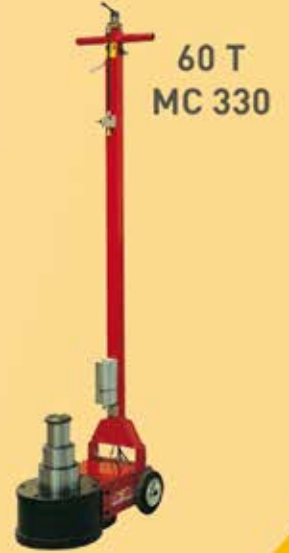
60 T MC 330